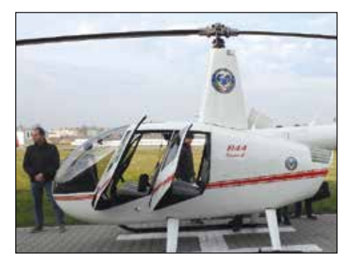
One of two R44s delivered to Polish Air Force University

Founded in 1927, the Polish Air Force University is an accredited state owned institution that offers undergraduate degrees for officers in the Polish military as well as commercial ratings for civilian students.