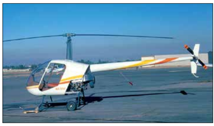
R22 serial number 0001 circa 1975

From certification to present day, the R22 has undergone many design improvements; increasing the maximum gross weight from 1300 lb to 1360 lb, adding a longer