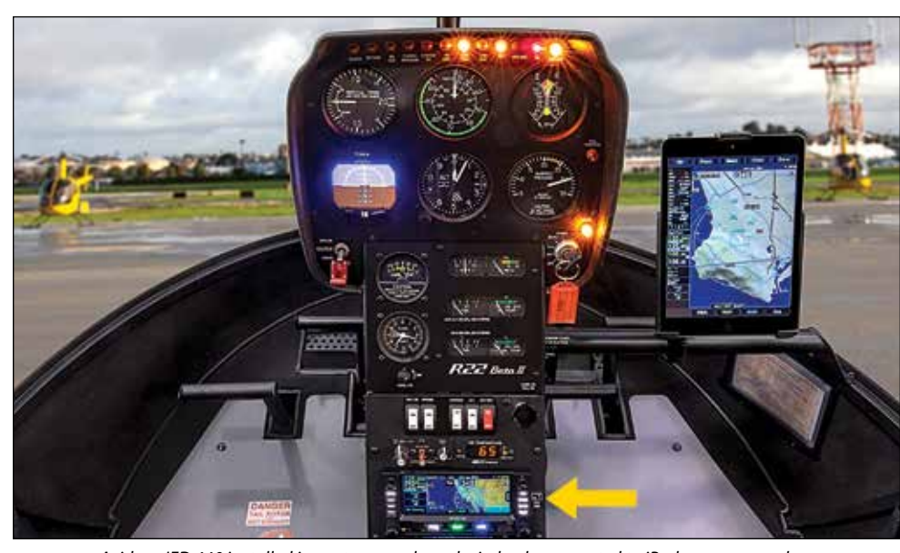
Avidyne IFD 440 installed in center console and wirelessly connected to iPad on accessory bar.

When used in conjunction with Avidyne's IFD100 app, an iPad may mirror the IFD display or may serve as an independent display capable of controlling the IFD. The IFD100 app is free and available on the Apple App Store.