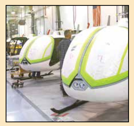
R66 final assembly line

Robinson's overall production in 2018 was 316 helicopters, a slight increase compared to 2017's production of 305. The R44 topped the list at 209 and again ranked as the world's best-selling helicopter according to GAMA's General Aviation Aircraft Shipment 2018 Year End Report. Production of the R66 and R22 were consistent with 2017, finishing at 74 R66s and 33 R22s.