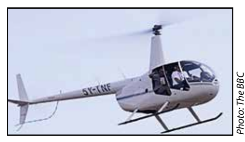
R44 passengers drop seedballs

With deforestation and soil erosion threatening to turn much of Kenya into an arid wasteland, a conservation organization named Seedballs Kenya is fighting back with the help of an R44 helicopter.