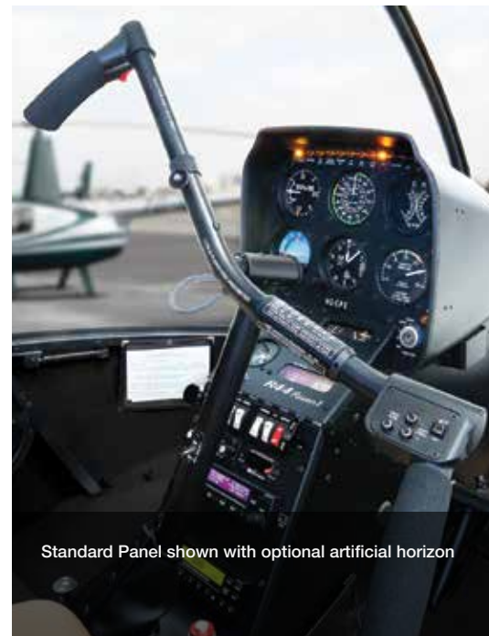
Standard Panel shown with optional artificial horizon