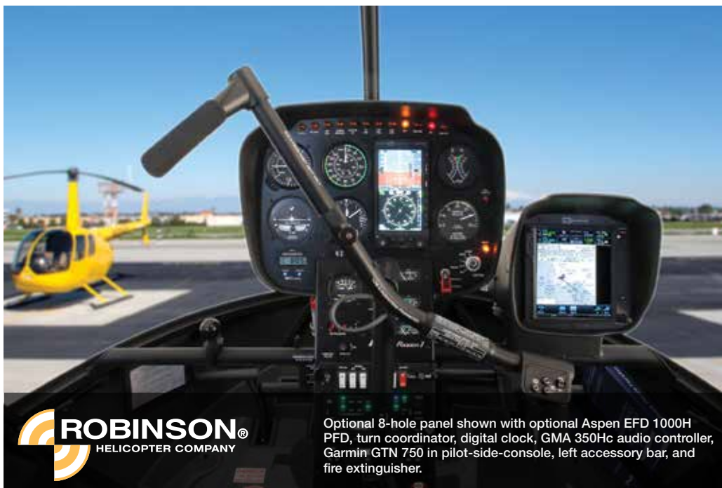
Optional 8-hole panel shown with optional Aspen EFD 1000H PFD, turn coordinator, digital clock, GMA 350Hc audio controller, Garmin GTN 750 in pilot-side-console, left accessory bar, and fire extinguisher.