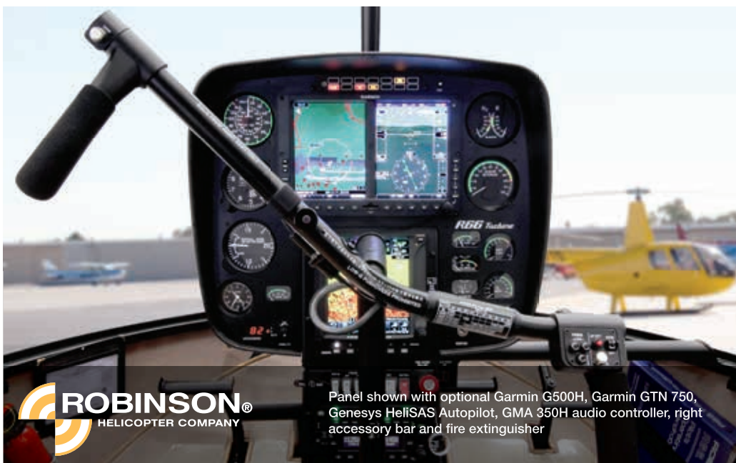
Panel shown with optional Garmin G500H, Garmin GTN 750, Genesys HeliSAS Autopilot, GMA 350H audio controller, right accessory bar and fire extinguisher