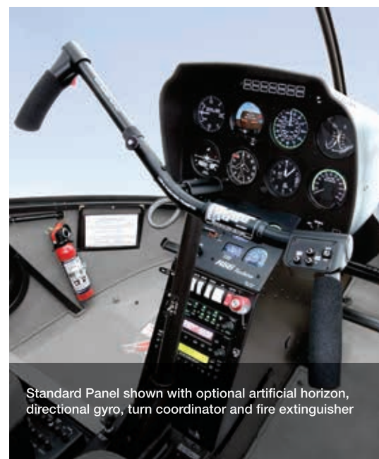
Standard Panel shown with optional artificial horizon, directional gyro, turn coordinator and fire extinguisher