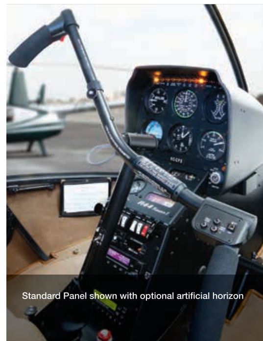
Standard Panel shown with optional artificial horizon