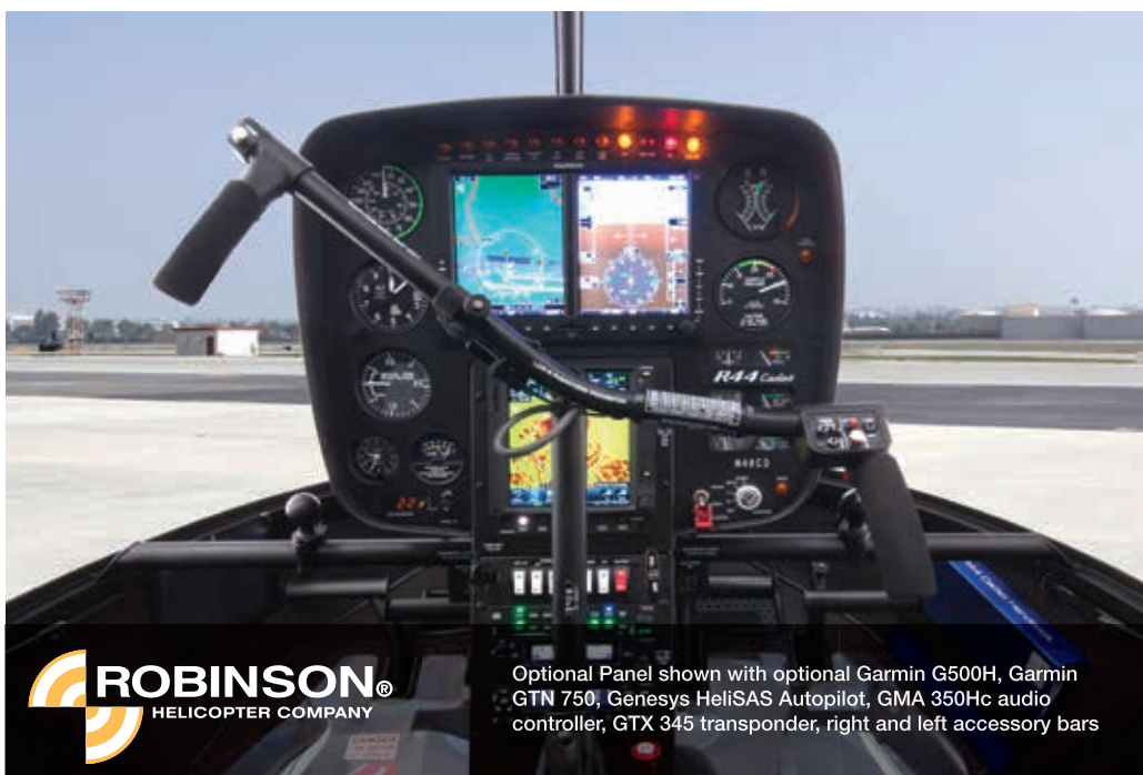
Optional Panel shown with optional Garmin G500H, Garmin GTN 750, Genesys HeliSAS Autopilot, GMA 350Hc audio controller, GTX 345 transponder, right and left accessory bars